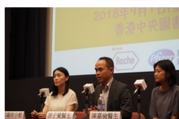
癌症探測及預防 Cancer Detection & Prevention