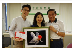
「改善癌病人生活」基金 Betterment Fund for Cancer Patients