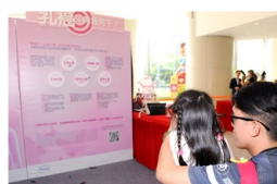
癌症教育 Cancer Education

The Hong Kong Anti-Cancer Society (HKACS), founded in 1963, is the most enduring non-profit making cancer organization in Hong Kong. HKACS is devoted to advocating cancer prevention through education, research, developing cancer screening and prevention guidelines as well as counseling services with the aim to increase knowledge and awareness of cancer among the general public. HKACS also provides a onestop nursing and rehabilitation service and offers different charity programmes such as "Charity Bed" and "Betterment Funds" to help cancer patients with limited financial resources to receive inpatient services and cancer treatment.